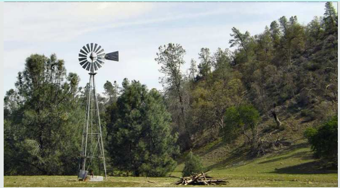
Windmill - water pump

Indian Valley Road runs north-south from San Miguel to Peach Tree Road (which continues north to CA-198). This is a beautiful back road drive through cattle country. It's a quiet and peaceful drive of about 25 miles.