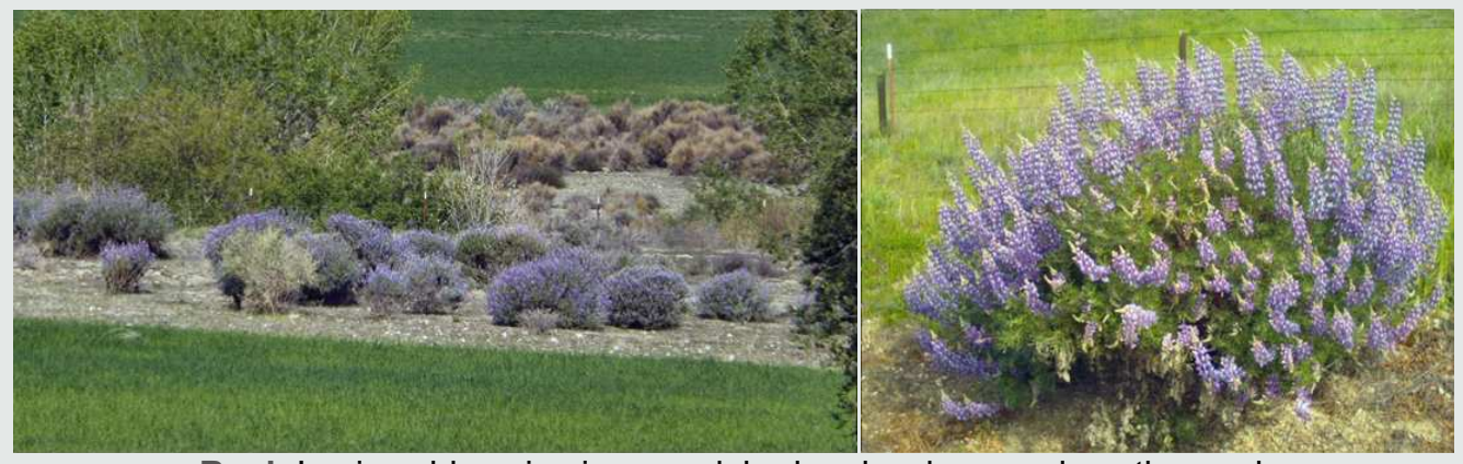
Bush Lupines blooming in a creek bed and a closeup along the road