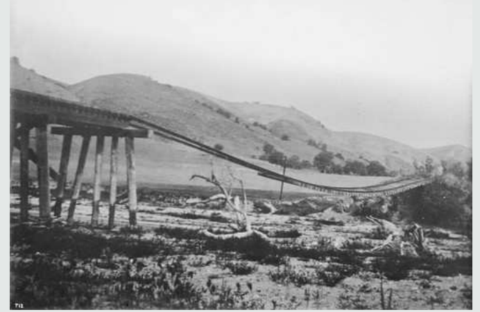
Stone Canyon Mine railway bridge - 1919

There was once a small town here called Valleton. It was located near the Stone Canyon and Pacific(?) Railway. There was a post office in Valleton from 1887 to 1918.