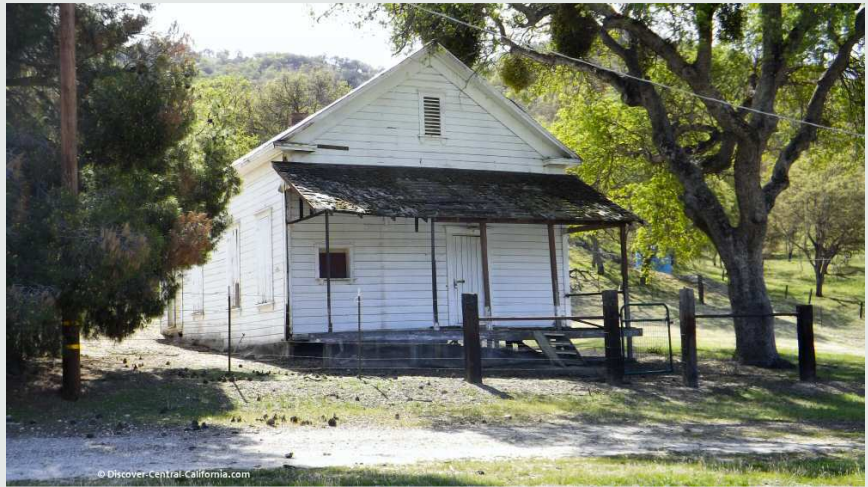
Possibly an old schoolhouse?

No, you didn't take a wrong turn and end up in the Himalayas...there are some yaks along the road here. They've been here for a number of years and seem to be dealing with the low altitude just fine.